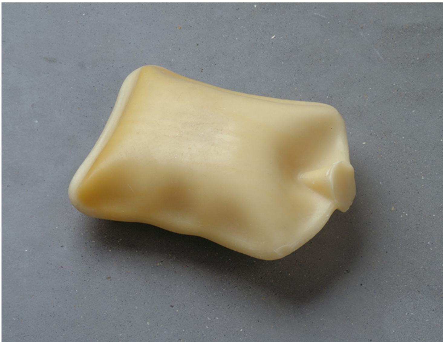
Untitled (Torso) / Rachel Whiteread / c. 1992 / Wax