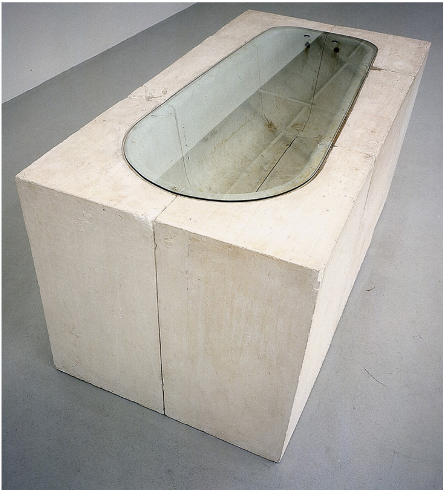
Rachel Whiteread / Untitled (Bath) / 1990 / Plaster and glass

One year later Whiteread's notoriety had furthered her career as she was