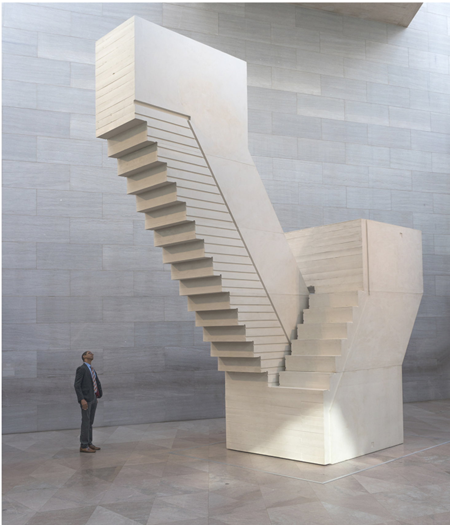
Untitled (Domestic) / Rachel Whiteread / 2002 / Cast plaster on various