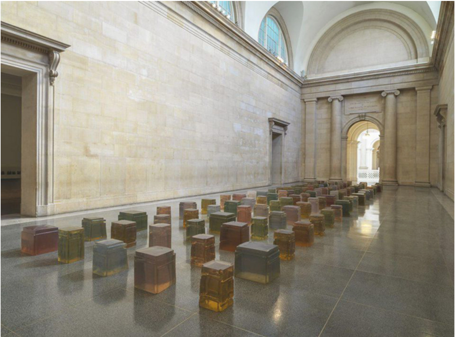
Untitled (One Hundred Spaces) / 1995 / Rachel Whiteread / Tate Britain