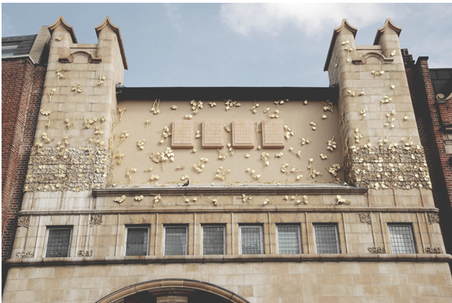
Tree of life / Rachel Whiteread / 2012 / Bronze, premanent installation at Whichapel Gallery, London

Whiteread had her second son in 2007, while her work made a shift towards a smaller scale, allowing her to return to the physical engagement with materials that she had sorely missed from her early career, as she explains, “I changed my way of working a few years ago in that I used to have lots of assistants and then realised that wasn’t for me. A lot of the early work is based on my size and what I could lift. I still bring in people to help me when needed, but I love doing the smaller things myself and I try to keep my touch on the work. It goes back to the beginning.”