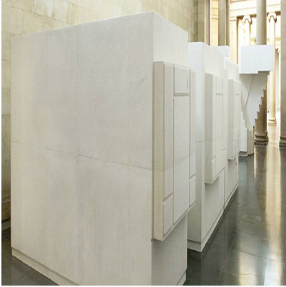
Rachel Whiteread: Material Space