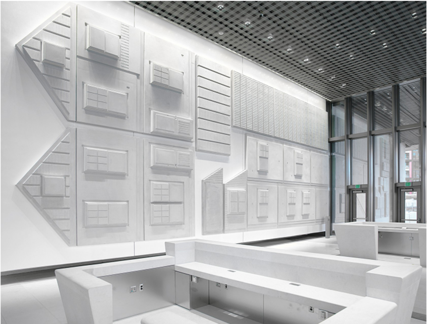
US Embassy (Flat pack house) / Rachel Whiteread / 2013-15 / Concrete

seen in her deliciously pastel toned Line Up , 2007-8, made from casts of toilet roll interiors. More recently, in a poignant memory to the city of London Whiteread was asked to create a frieze for a blank space above the Whitechapel Gallery for the 2012 London Olympic Games which she chose to decorate with cast golden leaves; titled Tree of Life , she called the work “a gift to the area” where she continues to live and work.