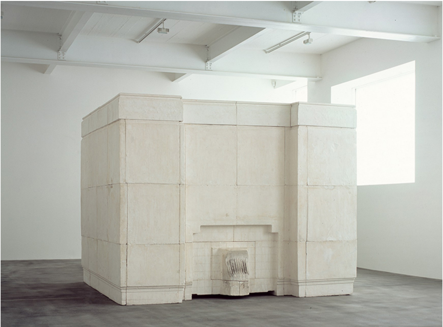
Ghost / Rachel Whiteread / Plaster and steel frame

In 1990 Whiteread made her breakthrough work, Ghost , 1990, a cast of an entire Victorian living room in North London. Monumental in scale, the work became a haunting memorial to a forgotten place, while the process of casting gathered evidence of human life including soot in the fireplace, intricate wallpaper patterns and scratched, worn skirting boards. Whiteread spoke at the time of her process, saying she was “mummifying the air inside the room,” nodding towards the uneasy, embalmed quality of the work.