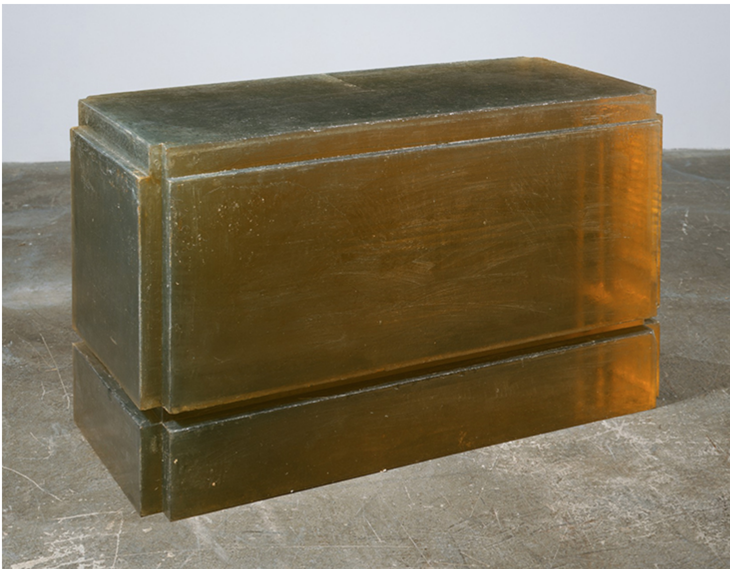
Untitled (Table) / Rachel Whiteread / 1993 / Resin

In the early to mid-1980s Whiteread studied painting at Brighton Polytechnic, although towards the end of her degree she was already moving away from two-dimensions. “I couldn’t make things stay on the wall,” she recalled, “they always ended up on the floor.” Her tutor, British artist Richard Wilson, taught her how to make casts from ordinary objects including a humble spoon, which opened her eyes to the technique’s transformative potential.